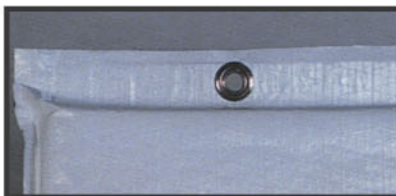
"B" Clean, Smooth Facing