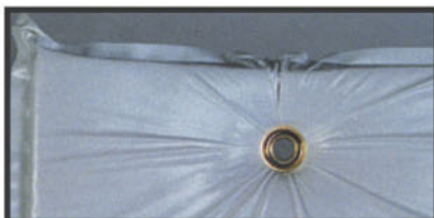
"A" Slight puckering on fabric face