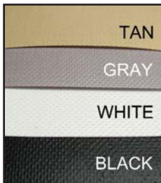
Facing Color Options